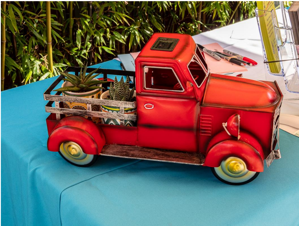
Plant Sale