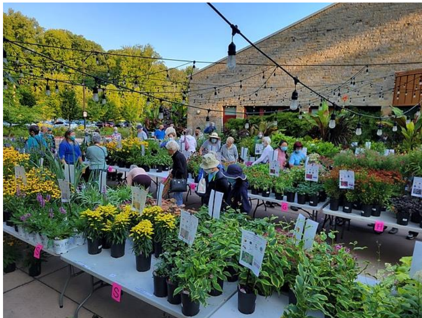
2021 Plant Sale

Once again, FOBG would like to thank its members and the public/non-members for their overwhelming support, and the Brookside Gardens staff and Montgomery Parks for their continued support in helping with the 25 th Anniversary Plant Sale . We would also like to acknowledge the help and support we received from Quality Greenhouses and Perennial Farms Inc. in providing us with a great inventory of plants. Looking forward to seeing you in 2022!!