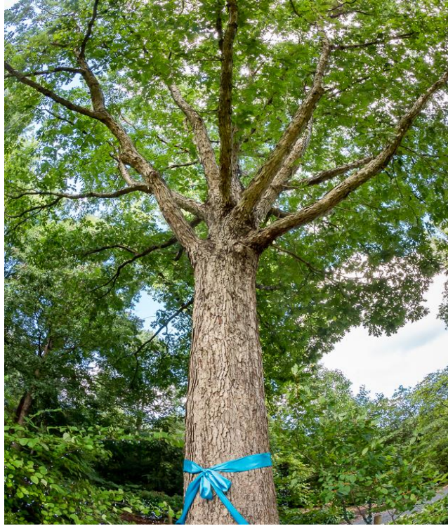
Quercus alba , the Friends Tree