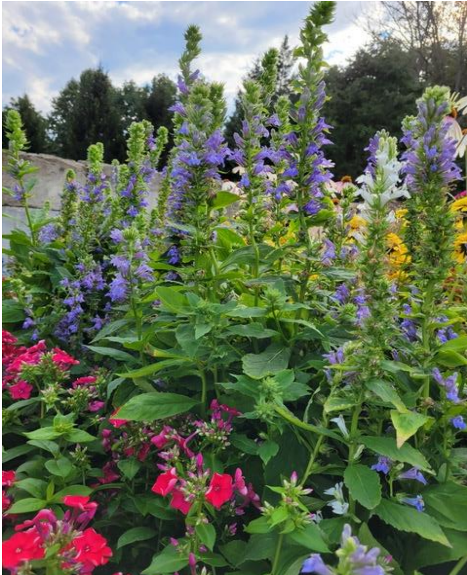
2021 Plant Sale

Please note that the “News from Brookside” and “Garden Guardian” columns will return in the Winter 2022 issue of The Brooksider.