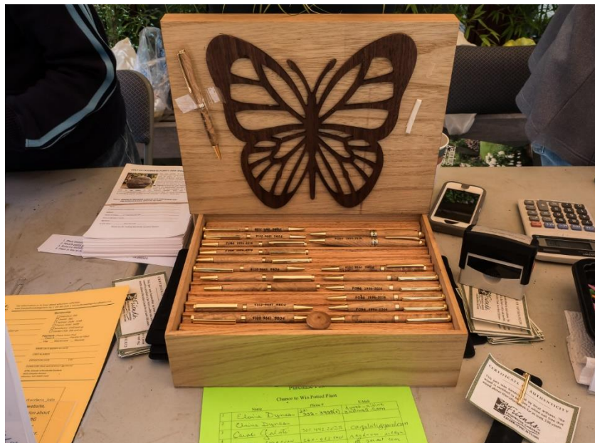
Handcrafted pens using wood from Brookside Gardens