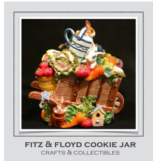
FITZ & FLOYD COOKIE JAR CRAFTS & COLLECTIBLES