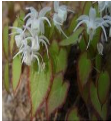
E. sempervirens 'Cherry Hearts'