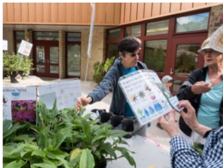
Plant Sale 2017