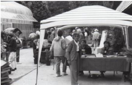
First Plant Sale 1996