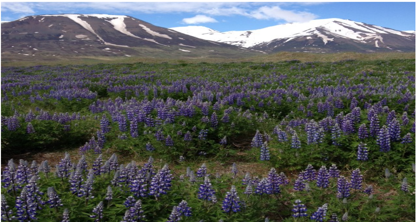
Lupinus in Iceland

...and that was just the Akureyri Botanic Garden!! There was soooo much more in the rest of Iceland!!