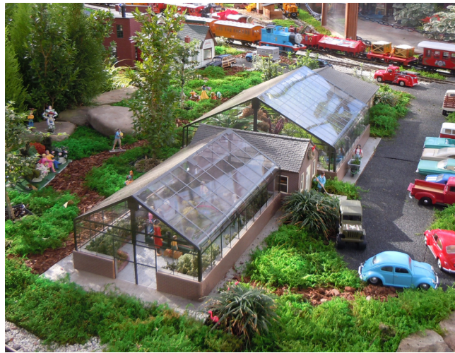
The model Conservatory at the 2023 Garden Railway Exhibit

Children and adults alike were delighted this winter by the return of the Garden Railway Exhibit in the Conservatory. Brookside Gardens organized this exhibit in partnership with the Washington Virginia Maryland Garden Railway Society. It was last held in 2019. G-scale trains and custom model buildings created a unique miniature landscape of Montgomery County landmarks, including Glen Echo Amusement Park, and the Brookside Conservatory itself. In addition to 30 members of the Railway Society, the exhibit was staffed by 27 volunteers from Brookside Gardens , including some FOBG members. Over 13,000 visitors toured the exhibit, which ran from November 25 to January 1.