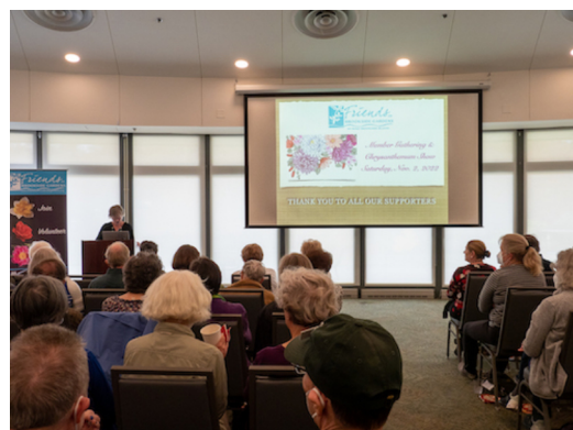
FOBG Members in Auditorium